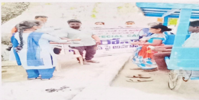
Students of St Anns College creating awareness about COVID-19 at Gorantla Village